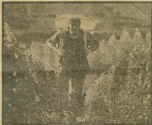
To drink in 20 or 100 years' time?