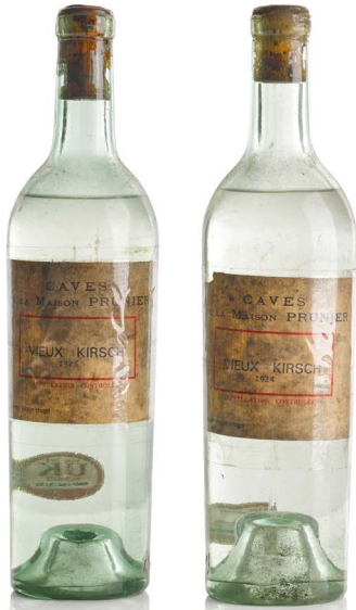
LOT 346, 347